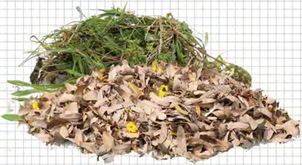
Leafy Green Waste