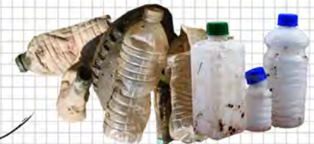
Low grade/dirty plastic bottles/containers

All combustible mixed general waste must be packed in jumbo bags.